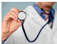
Healthcare Contextualized Curriculum

Click here to access the contextualized curriculum.