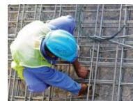
Construction Contextualized Curriculum