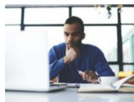
Digital Literacy Contextualized Curriculum