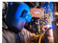
Manufacturing Contextualized Curriculum