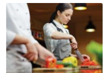
Hospitality Contextualized Curriculum